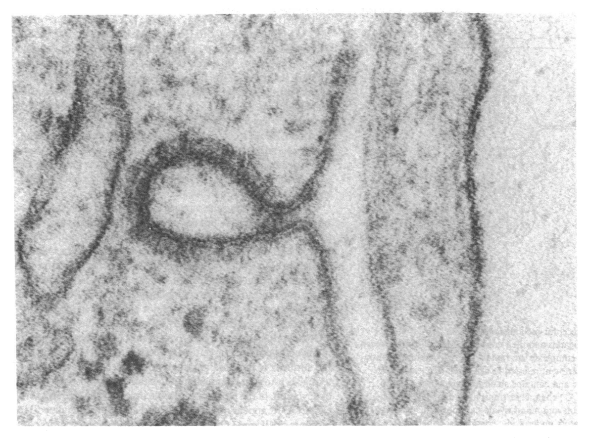
Figure 1. Transmission electron micrograph of hepatic parenchymal cell demonstrating coated pit. An endothelial cell lies to the right of the hepatic parenchymal cell.